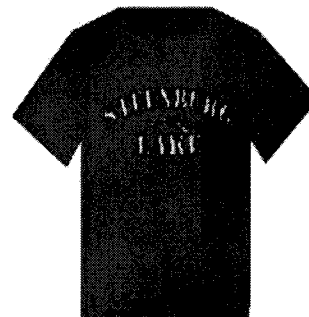
Youth Camo design. (Logo will be subtle)